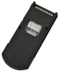
Fig. 2 Impedance micro-fluidic chip in plastic frame.

The heart of the cytometer consists of a microfluidic chip supplied with microelectrodes (Fig. 2). In this chip we measure changes of the electrical resistance of a fluidic medium when particles or cells pass through the applied electric field (Fig. 3). The high sensitivity of the device is achieved by adjusting the channel dimensions close to the size of the measured cell type, increasing thereby the ratio between cell and detection volume. Thus, for the various cell types chips with different channel dimensions are available for optimal sensitivity. The main difference from the Coulter principle is that we are measuring with AC (alternating current) over a broad frequency range, while Coulter works with DC (direct current) or with AC at very low frequencies.