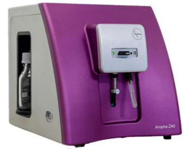
Fig. 1 Amphasys' Impedance Flow Cytometer.

Impedance-based single cell analysis systems, also known as Coulter counters, represent a well-established method for counting and sizing any kind of cells and particles. This technology, however, was until recently not suitable for cell characterisation applications, for which advanced and powerful fluorescence-based cell analysis and sorting devices (FACS) provide the gold standard in research and clinical laboratories. The advent of microtechnology in life sciences provides nowadays new possibilities to improve the sensitivity of electrical detection methods, revitalising the perspective of a simpler and label-free cell analysis approach. Here we describe the technology of this novel impedance-based microflow cytometer (Fig. 1), which will conquer application fields that were so far unachievable.